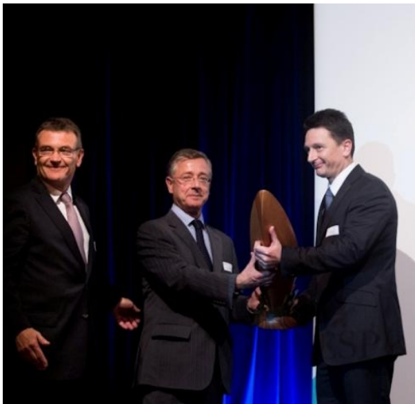
4 November 2014: ESPO Award Ceremony at the Albert Hall, Brussels Town Hall

The seventh ESPO Award will be officially handed out during an ceremony which will be held on Tuesday 10 November 2015 in Brussels.